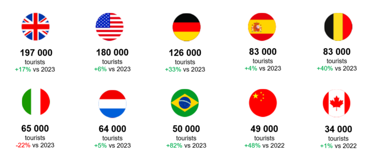
Figure 1 : Estimates based on ATR and Flux Vision data.

The main international customers during this period were English, American and German, who together accounted for 1/3 of international tourists (500,000 tourists out of a total of 1.5 million). Note the increase in visitor numbers from countries such as Brazil (+82%), China (+48%) and Belgium (+40%).