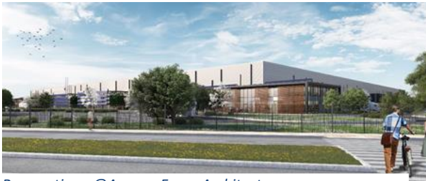
Perspectives